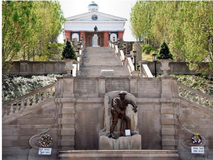
Monument Terrace - Lynchburg